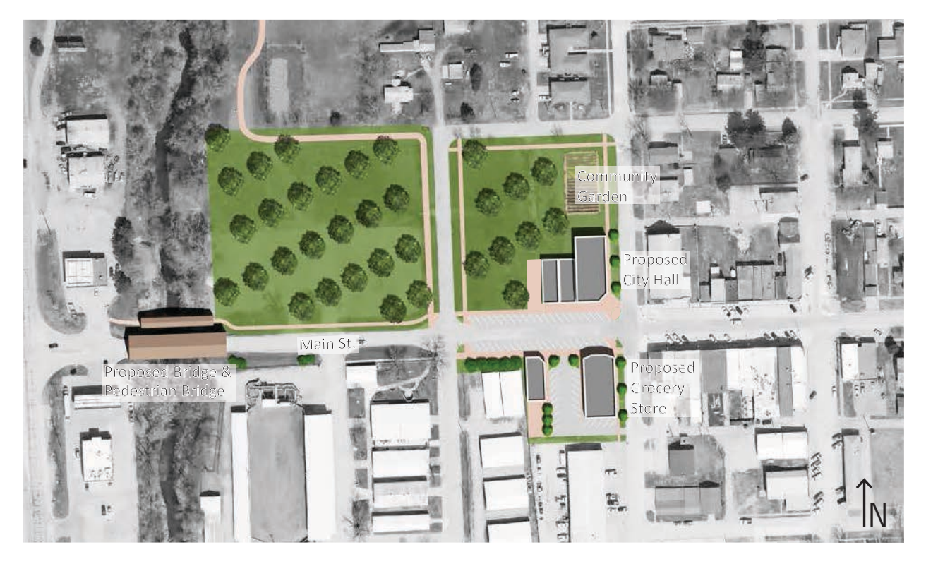
Figure 44 Urban Design Area 1: Main Street and Downtown