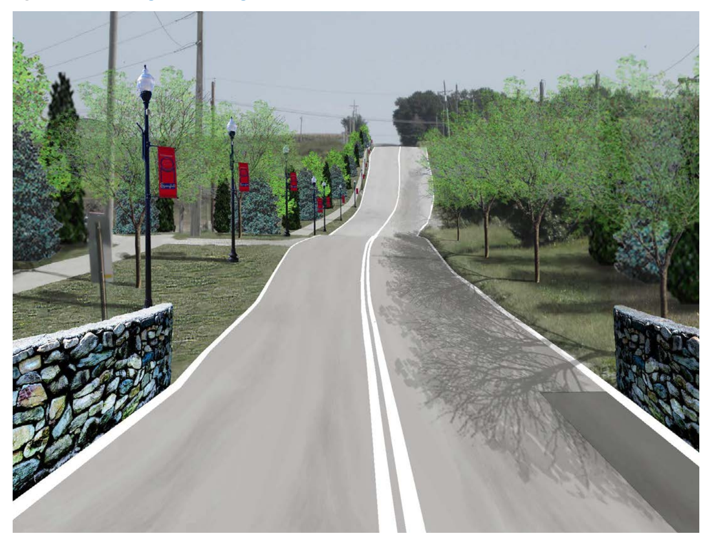
Figure 48 Urban Design Area 5: Pflug Road